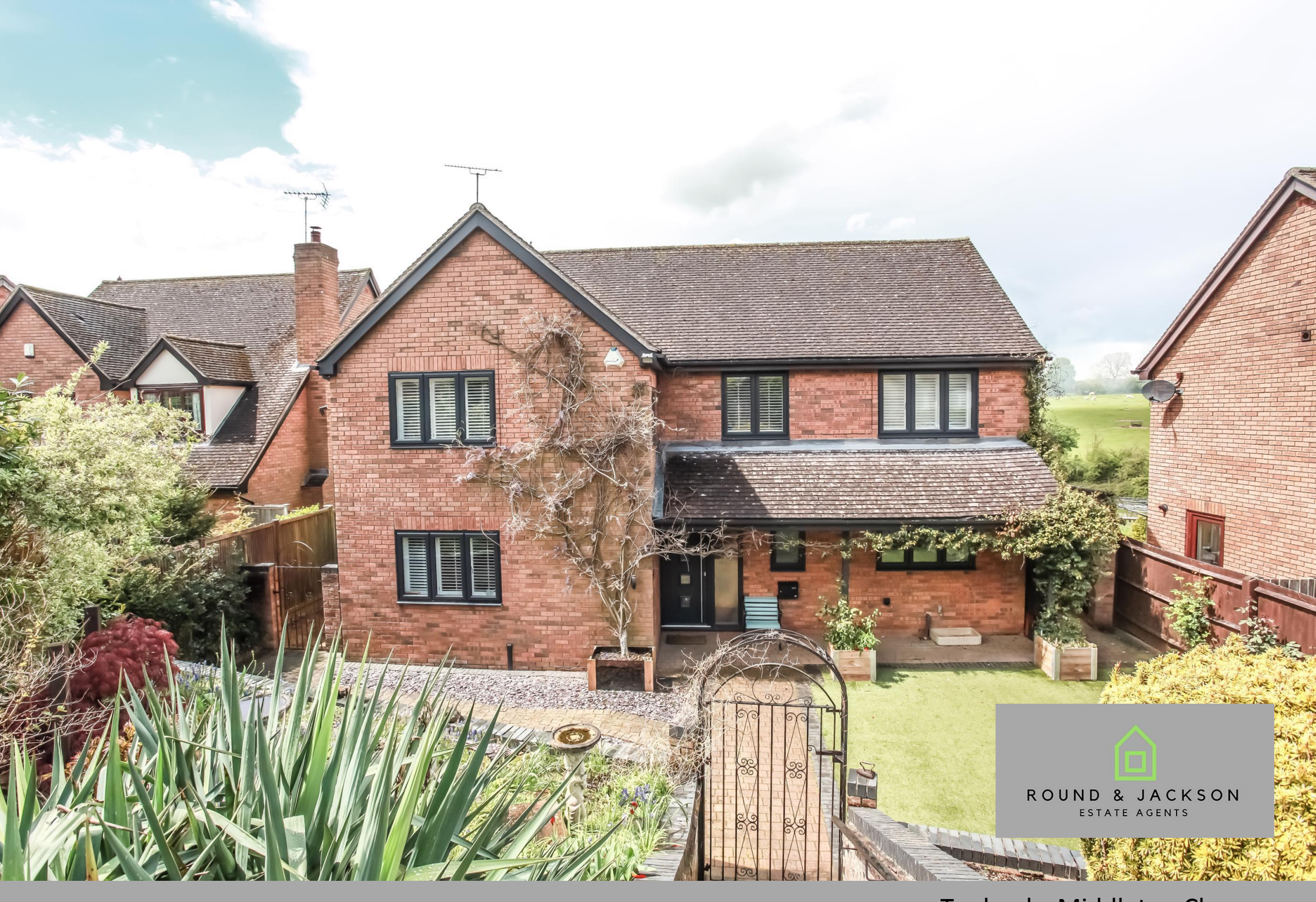
Tenlands, Middleton Cheney